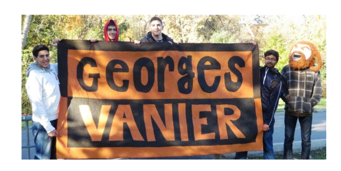
Students from Geroges Vanier SS showing the banner and mascot of their school during the walk.